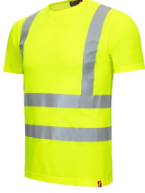
7008 // MOTION TEX VIZ Colour code: 4000