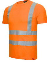
7008 // MOTION TEX VIZ Colour code: 4100