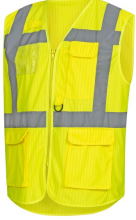
7118 Colour code: 4000