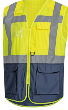
7118 Colour code: 4021