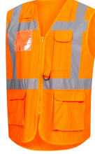
7118 Colour code: 4100