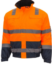
7142 // MOTION TEX VIZ Colour code: 4121