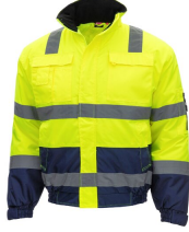
7143 // MOTION TEX VIZ Colour code: 4021