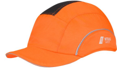
9552 // LITE SHIELD PRO Colour code: 4100