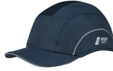
9552 // LITE SHIELD PRO Colour code: 2100