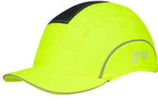
9552 // LITE SHIELD PRO Colour code: 4000