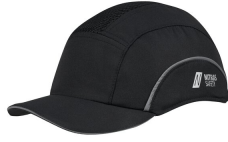
9552 // LITE SHIELD PRO Colour code: 1000